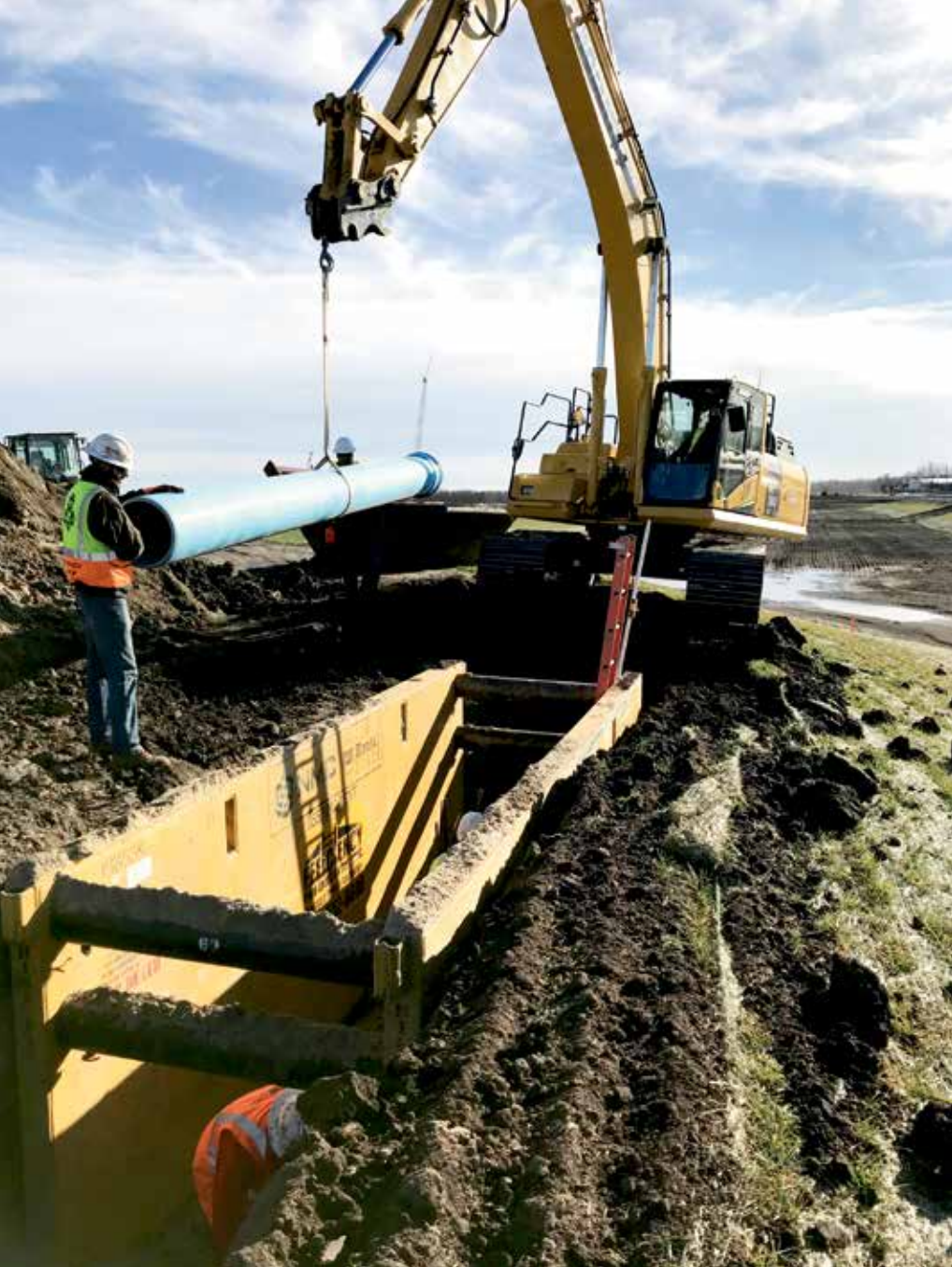
Crews use an excavator to install pipe on the project.

The two lift stations reach 36 feet and 27 feet into the ground. They will pump waste from the processing plant to the property line of a municipal water treatment plant, being built by the city of Fremont.