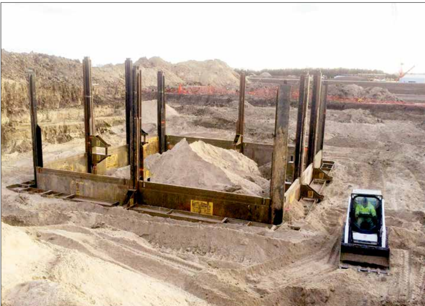
Sediment tanks are made for the lift station.