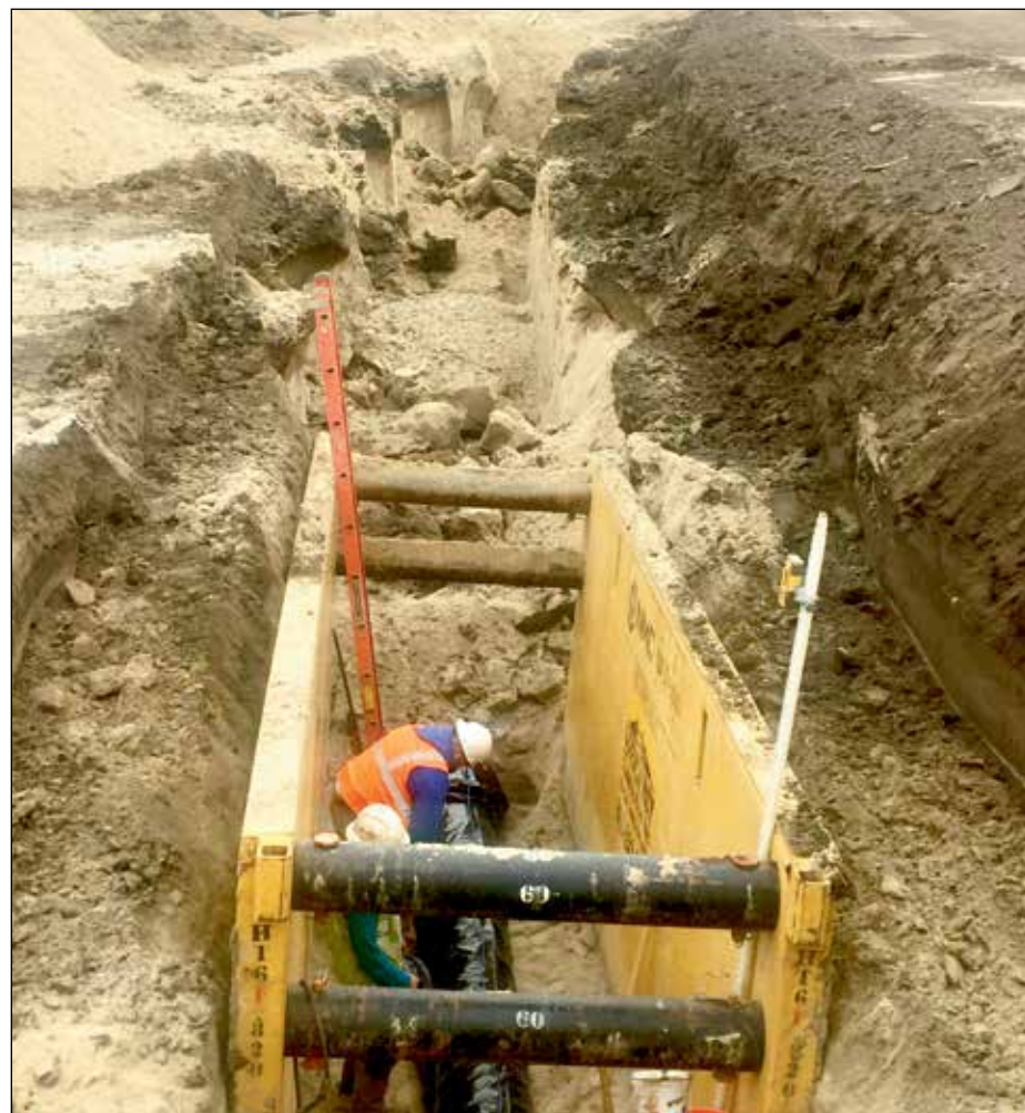
General Excavating crews install pipe.

Kolterman explains the automation will replace positions that are hard to fill and have a higher turnover rate. The facility will process whole broilers and boneless breasts, thighs, drumsticks and other chicken products.